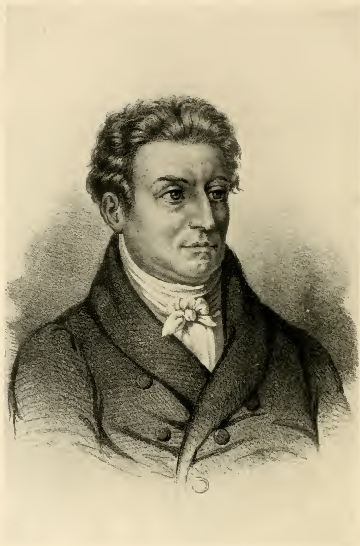
JOHANN GOTTLIEB FICHTE

AT THE TIME OF THE DELIVERY OF THESE ADDRESSES